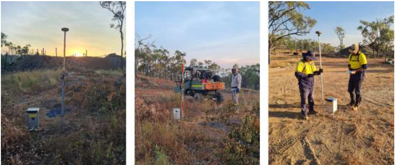
Figure 2 – Gravity survey underway around the Torpy's prospect.